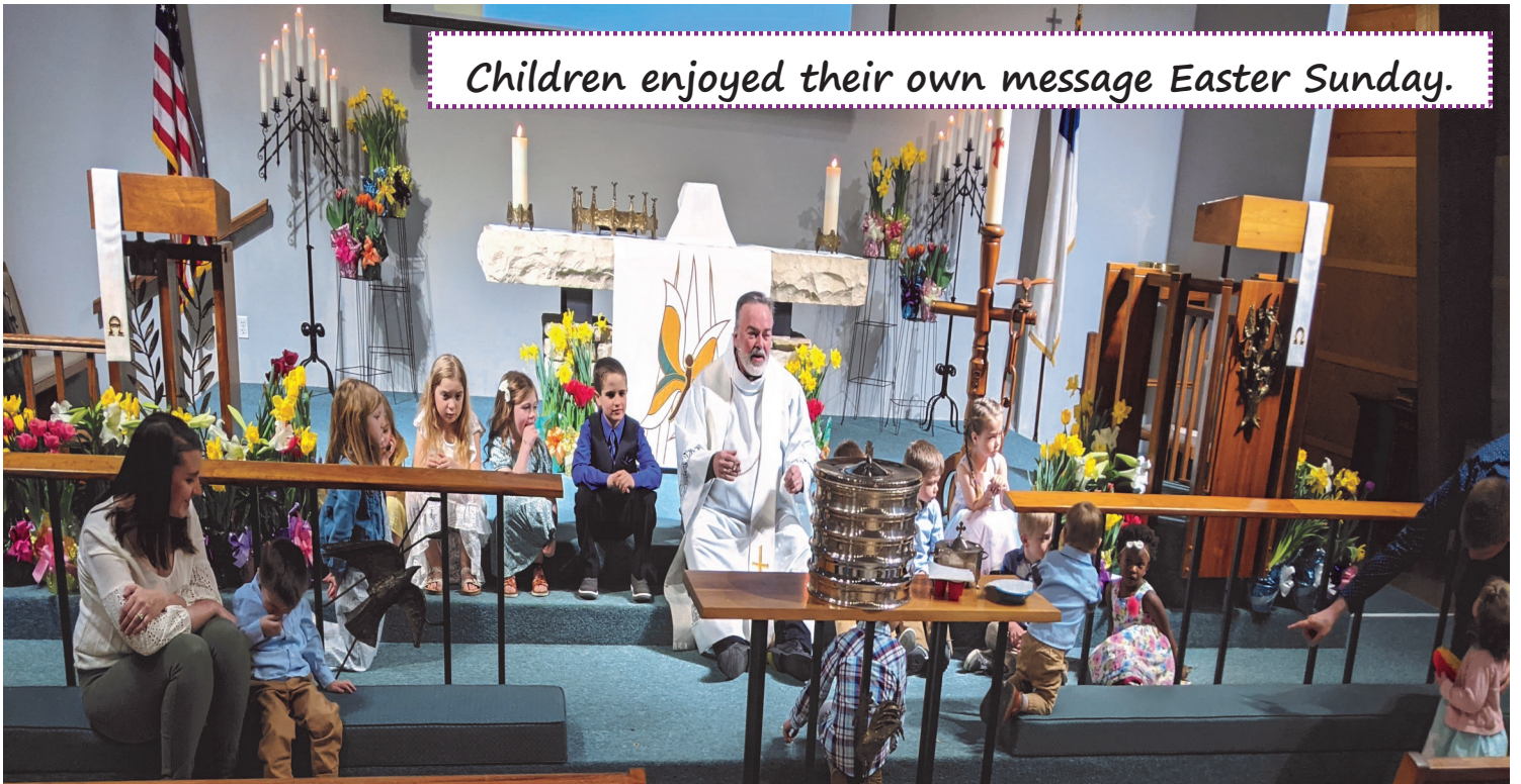
Children enjoyed their own message Easter Sunday.

It was a joyous Easter morning. God is Risen. He is Risen Indeed!