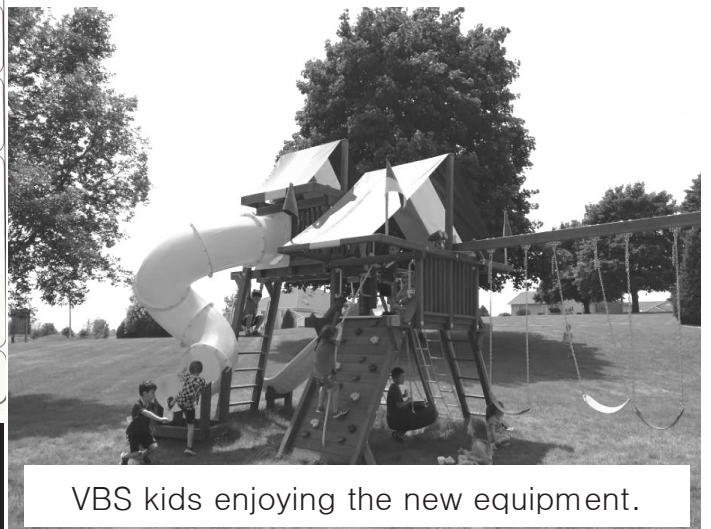
VBS kids enjoying the new equipment.

Donations are still being accepted for the new storage shed. Currently donations have totaled $1701.00 and the total approximate cost with building materials, cement and electrical is $9,000.00. Donations can be brought to the church office or placed in the white envelope in the pews marked "Shed" and placed in the offering plate.