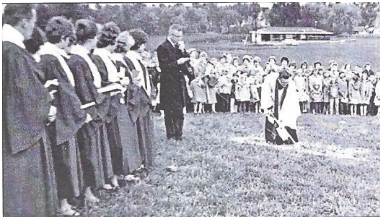
Groundbreaking for the new church was on Sept. 29, 1963.

Valders West also organized in 1850. The first church was an octagonal log building located on a hillside west of Valders, completed in 1856. The site was determined by a tree filling contest between two congregation members. A new church was built and dedicated in 1860. A modern parish hole was added and dedicated in 1898.