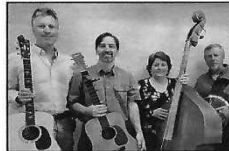
NorthWoods Gospel Rhineland, WI