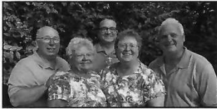
Voices of Peace Potter, WI