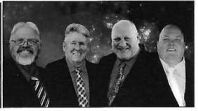
Common Bond Quartet Raceville, KY