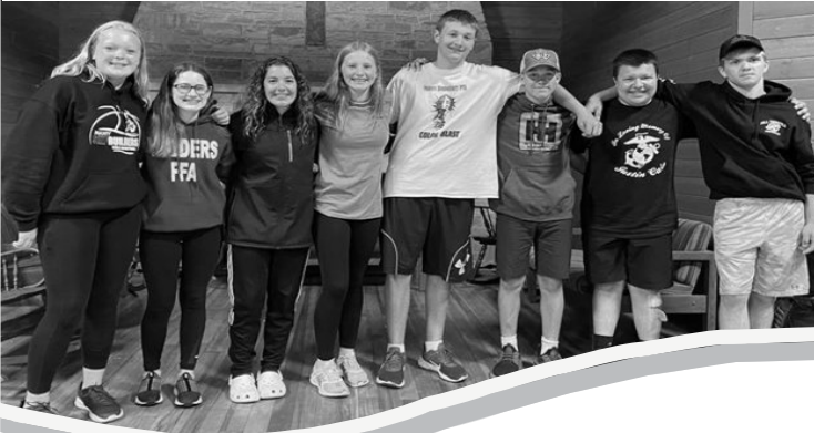
Our confirmation students had a great week at camp!