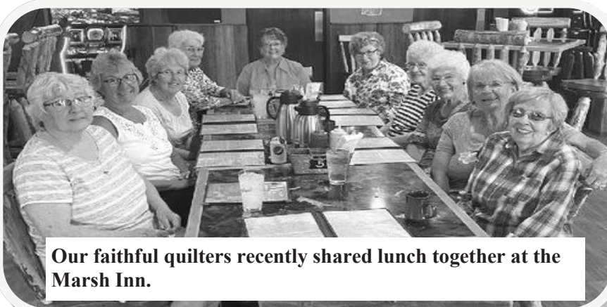
Our faithful quilters recently shared lunch together at the Marsh Inn.