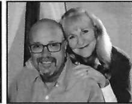
The Formans Fulton, MO