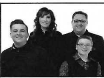
The Foresters Burton, MI