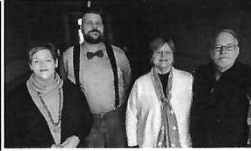
Loynachans Winterset, IA