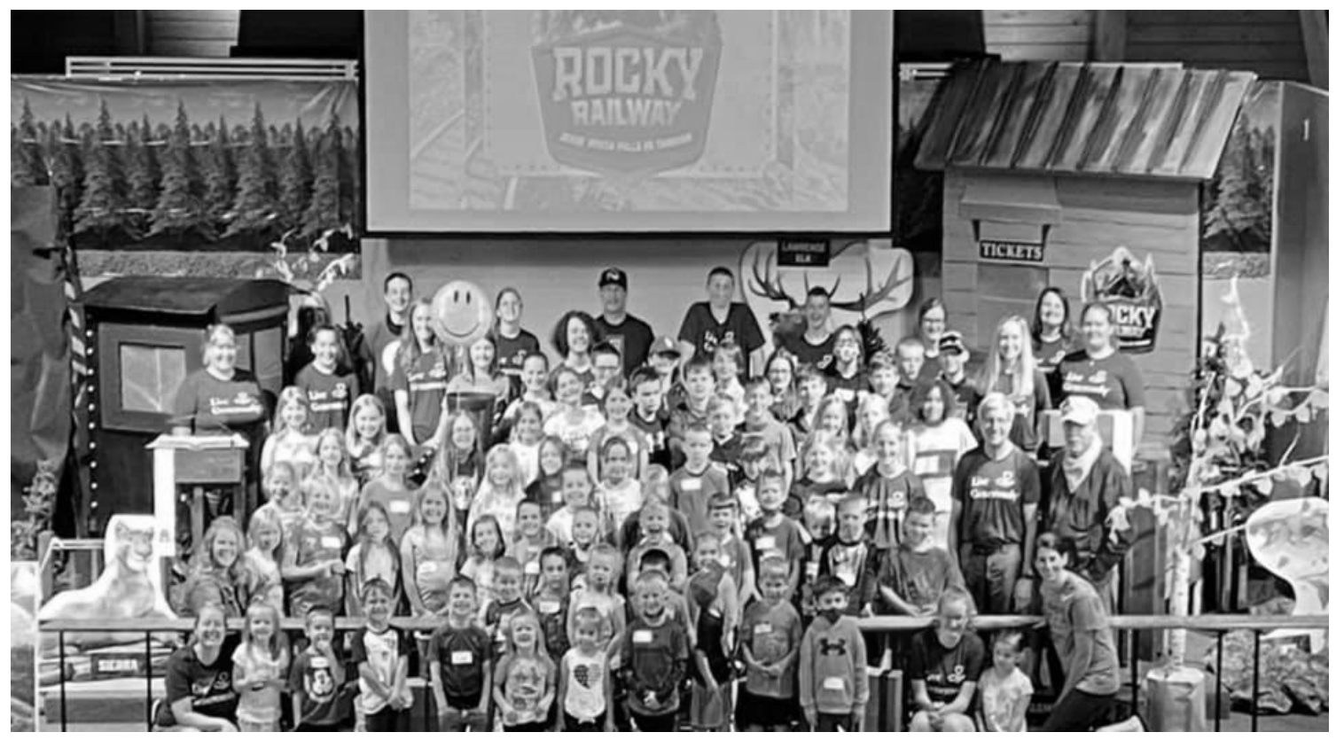
We enjoyed the sweet singing of this group while waiting to get our afternoon started, in the halls, in the sanctuary and even on the bus coming home from our field trip.